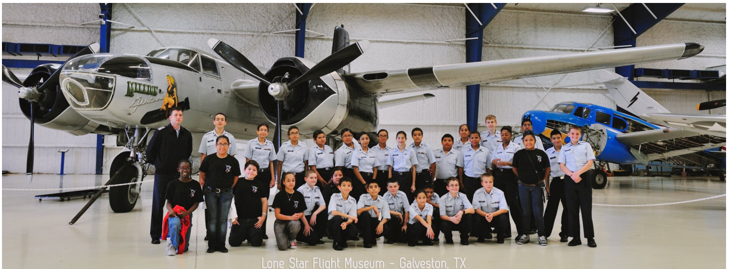
Lone Star Flight Museum - Galveston, TX