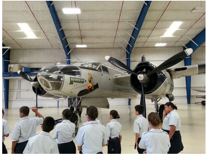
TX-802 Sheldon Cadets at the Lonestar Flight Museum